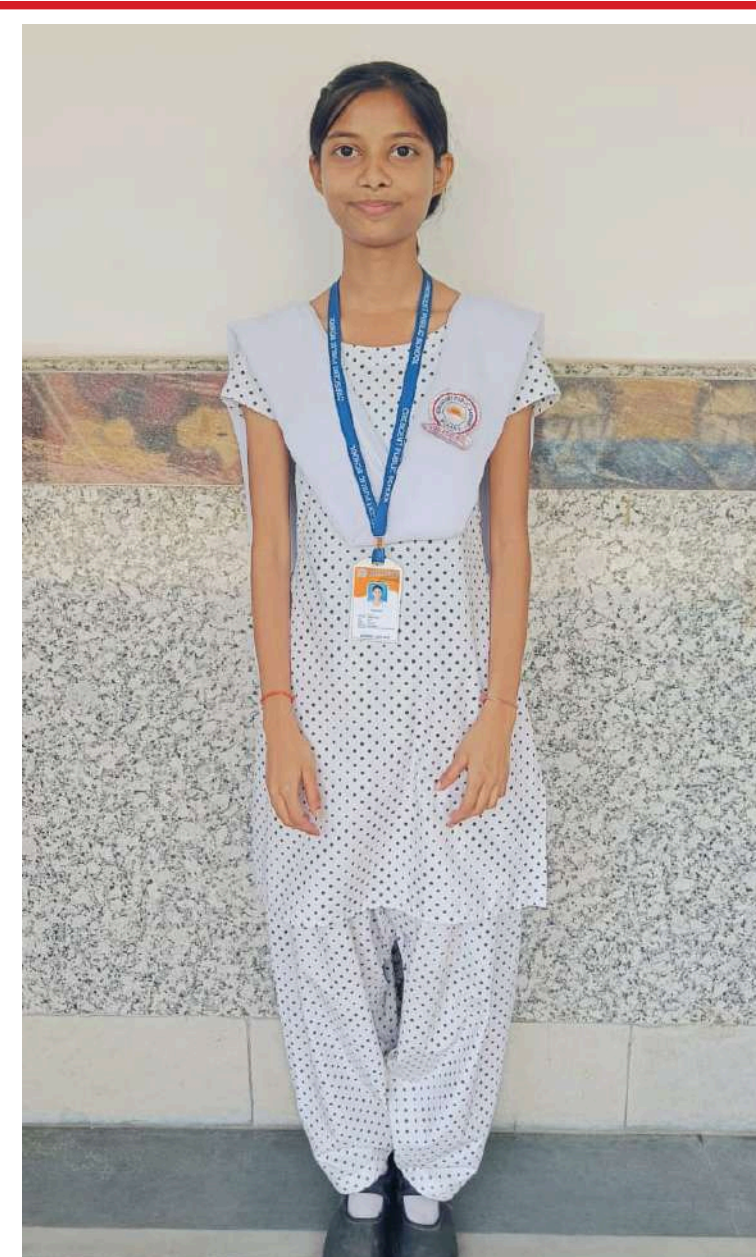
Secondary & Senior Secondary (Girls)