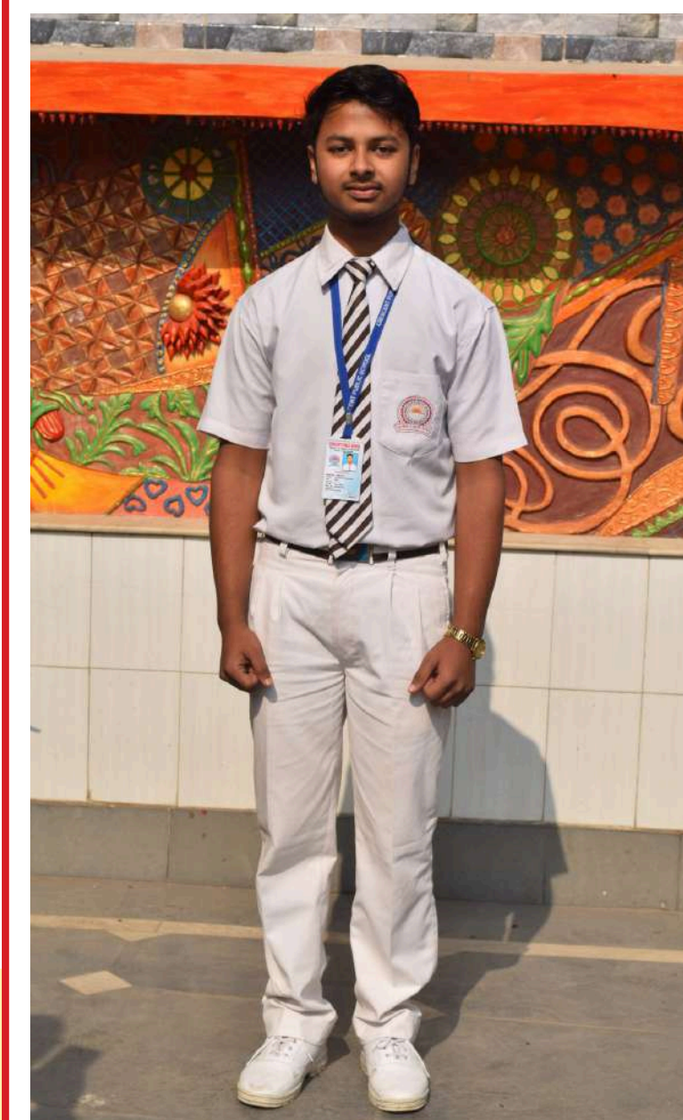
Ceremonial Uniform (Boys)