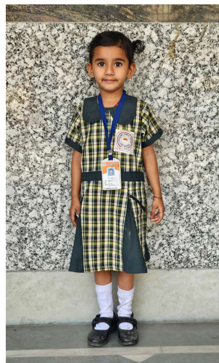
Pre Primary (Girls)