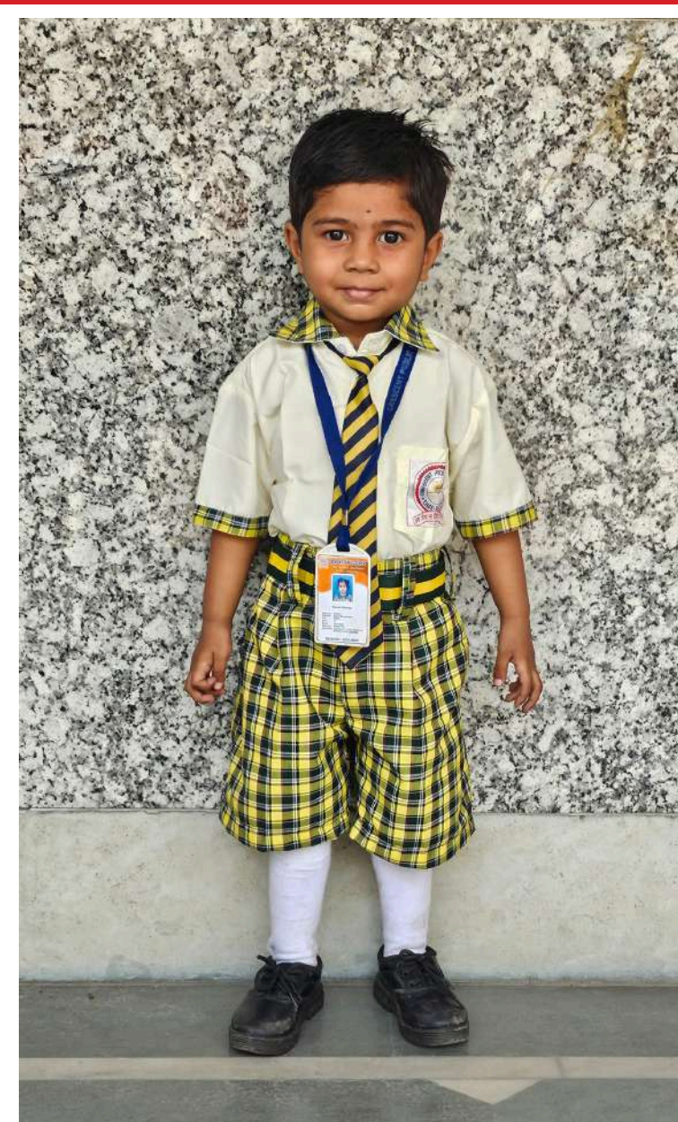
Pre Primary (Boys)