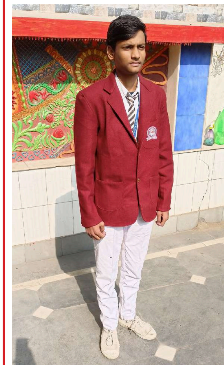
Middle & Secondary (Boys)