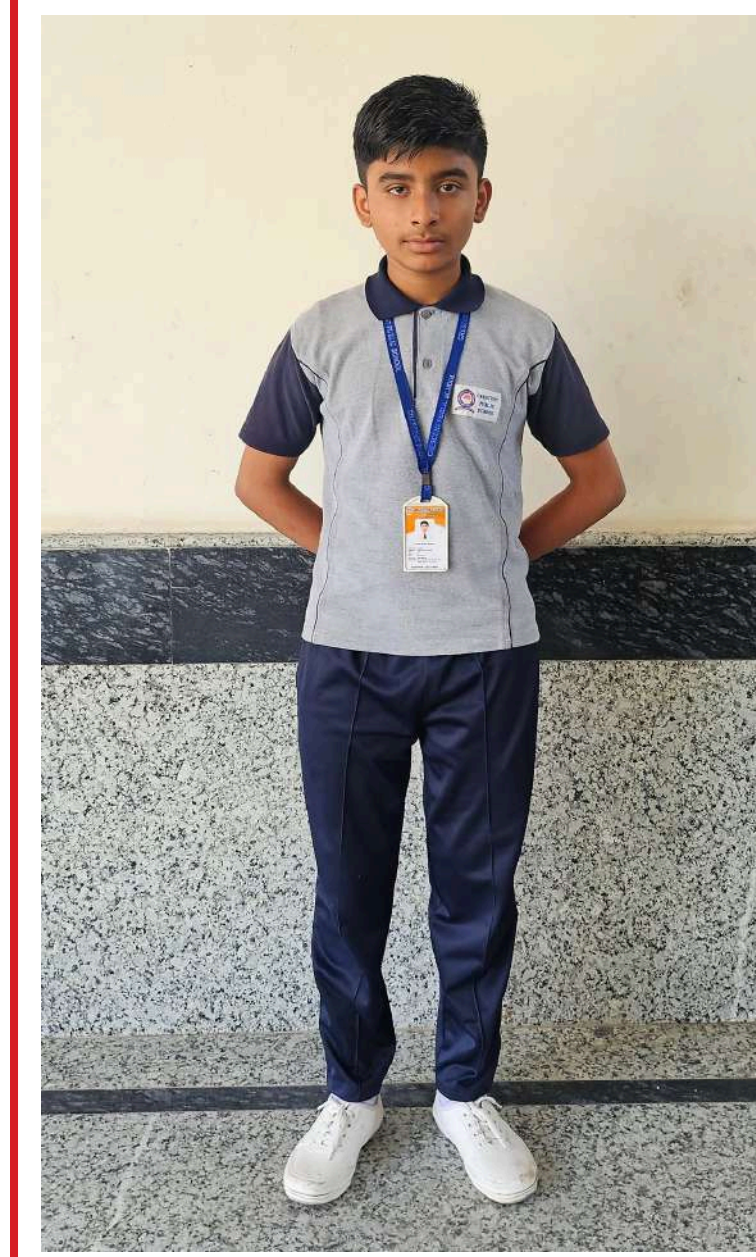
Sports & Activity Uniform (Boys & Girls)